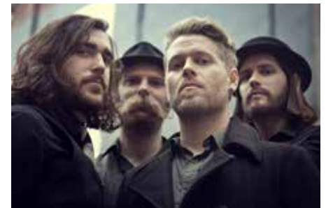
The Silent Comedy